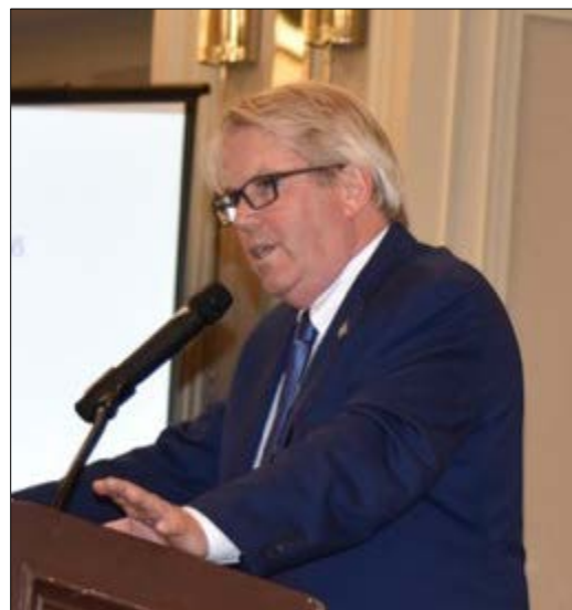
Rodger Cuzner, Parliamentary Secretary to the Minister of Employment, Workforce Development and Labour, Canada