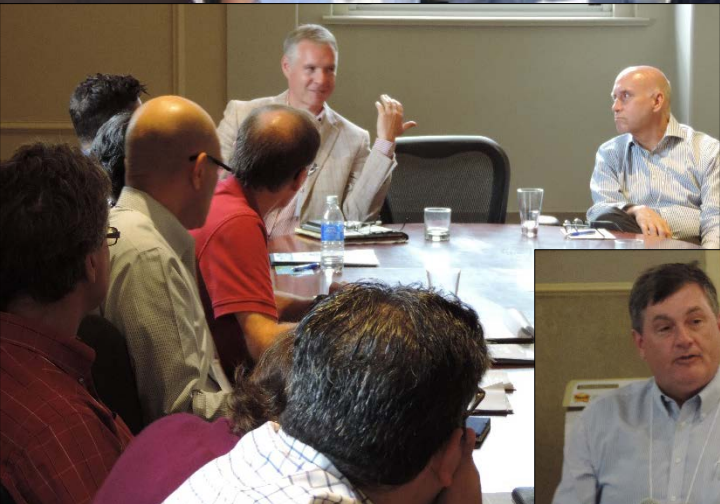
Left & Middle below: Breakout sessions