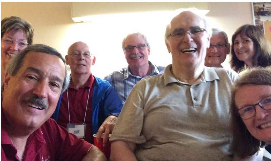
Left, L to R: