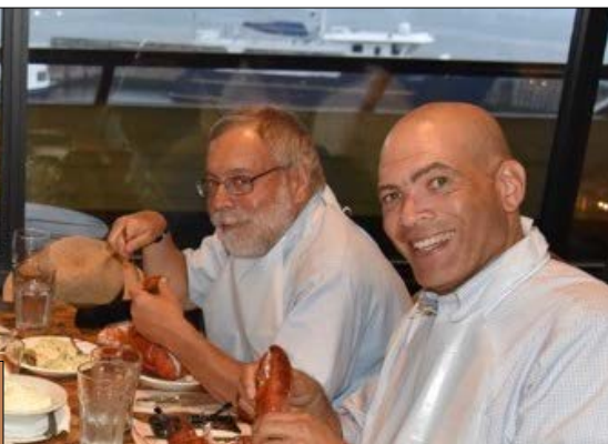
Above left: Attending the sessions